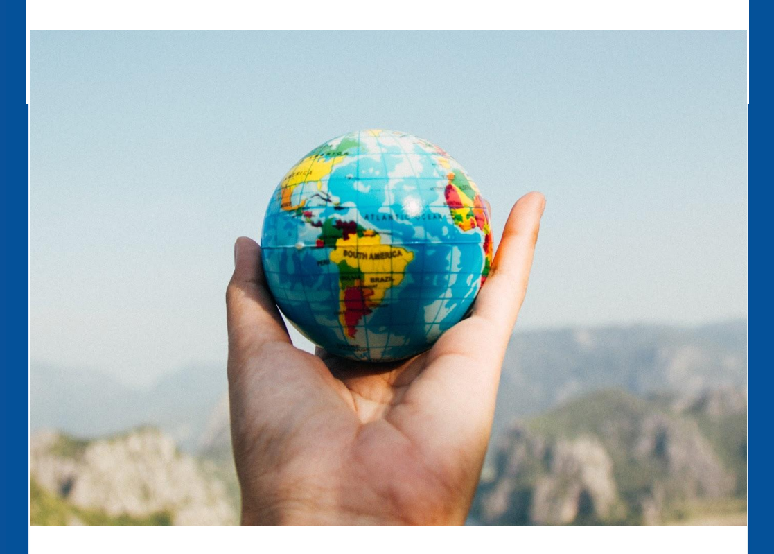
Serving the Needs of Humanity

This Super Unit is a structured inquiry into helping the learner understand other people. Learners will identify a local need of others and plan action. Learners will be empowered to authentically provide service to others. Learners will develop their ability to do service design thinking.